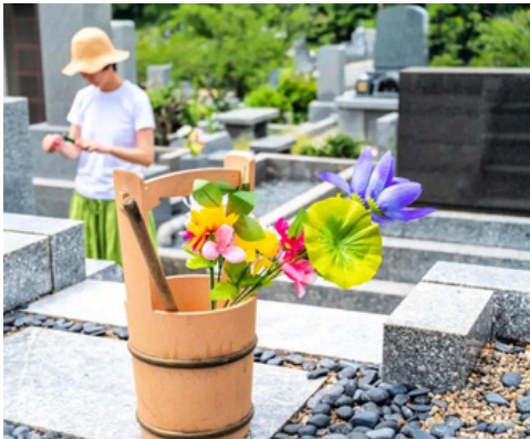
Japanese Higan traditions of visiting ancestors graves and reflecting on life's journey to enlightenment