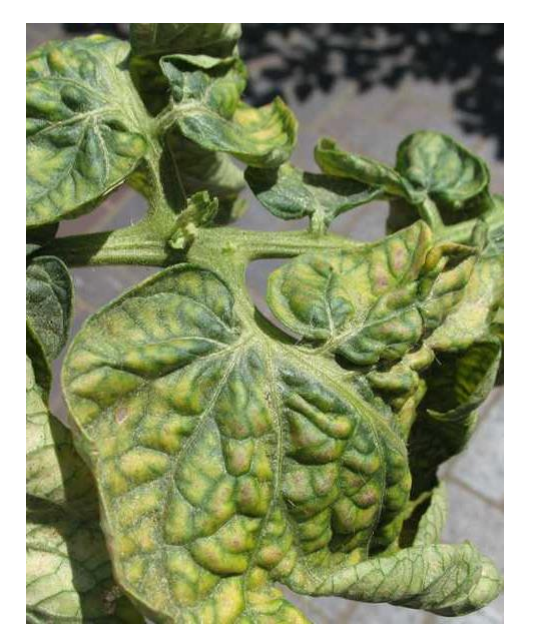
Copyright © 2015 Eldergrow. All rights reserved.