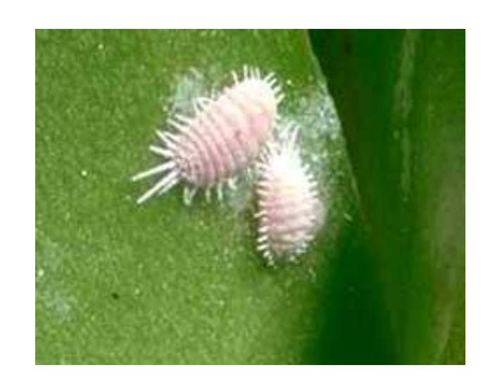
Copyright © 2015 Eldergrow. All rights reserved.

Small fuzzy white pests with soft scale-like bodies, that suck the sap out of plants. Tend to be in crevices.